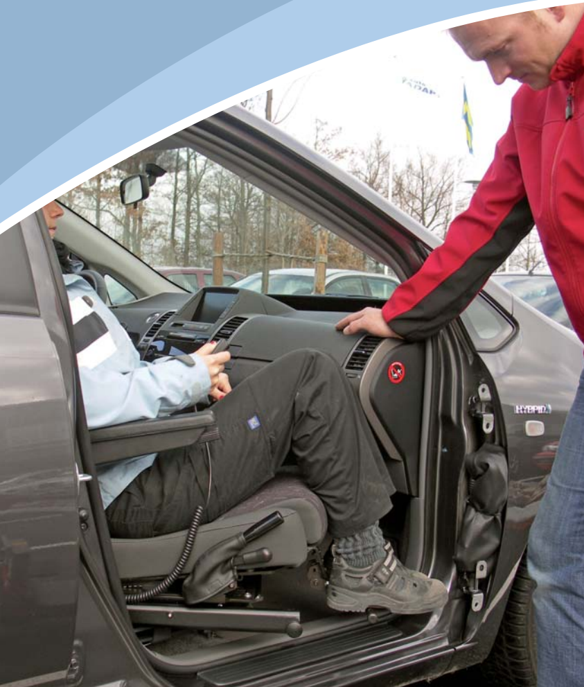
By keeping the feet on the footrest they won't need lifting.

tilts the seat and makes entering the car much easier