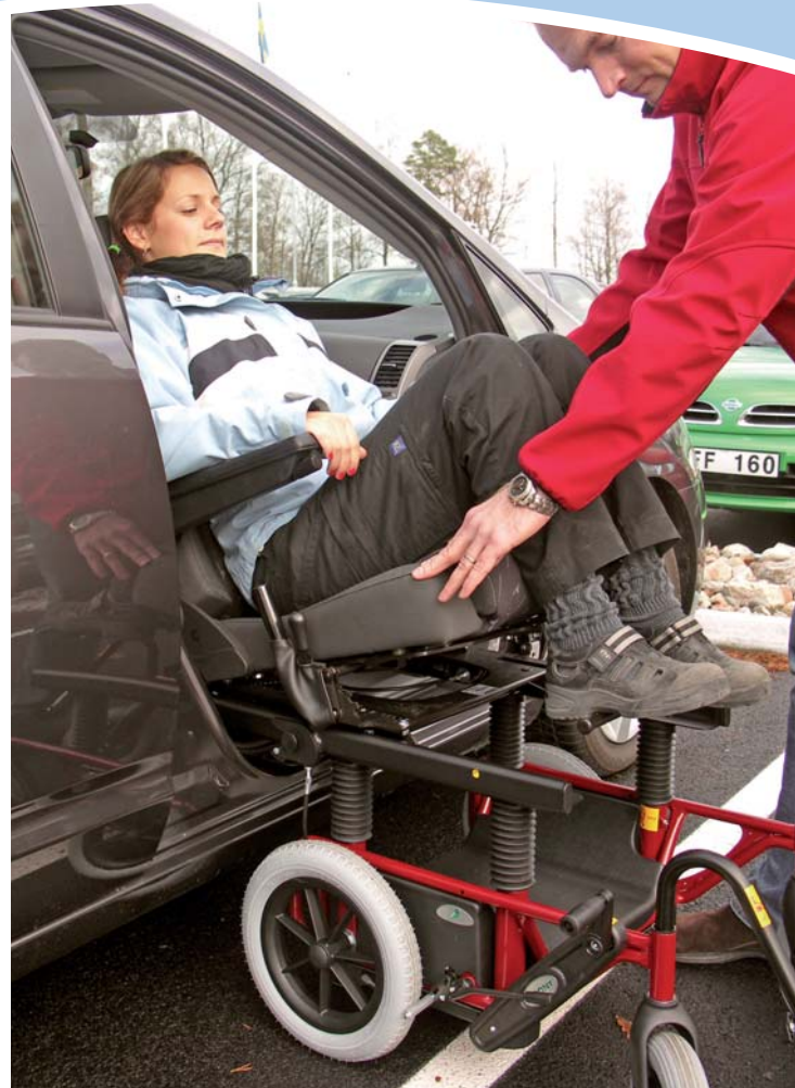
Tilda in combination with the Carony.