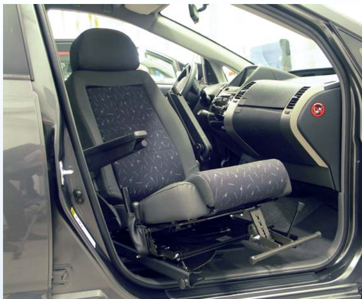
Tilda in position 3 and in combination with the TURNOUT swivel base, with the Carony rails mounted on the sides. The footrest is an option.

Please note that the footrest is an option.